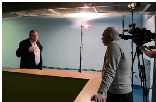
29.11.2012. TV Russia Cultural - “Black hole-white spots”

http://tvkultura.ru/video/show/brand_id/20863/video_id/177442