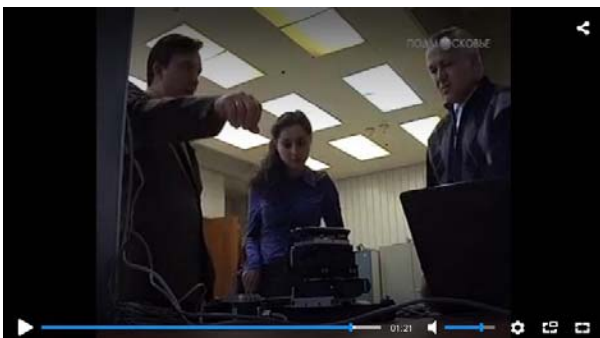
14.03.2012. TV Podmoskovie-“Innovation+” http://rutube.ru/tracks/5431453.html#cutid1-